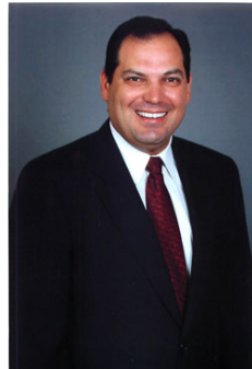
Juan de Dios "JD" Salinas County Judge